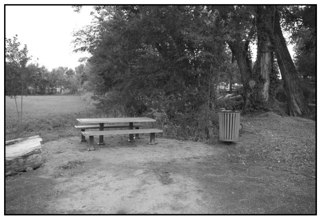
Right: One of the many new picnic tables and benches for visitors to enjoy the nature trail.